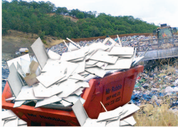
Typical scenario after replacement of stained ceiling tiles

E: info@suspendedceilingrestoration.co.uk W: www.suspendedceilingrestoration.co.uk